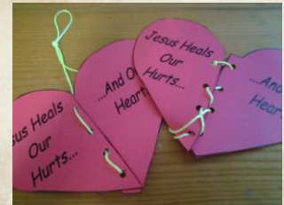
CLUBHOUSE KIDS LEARN HOW JESUS HEALS