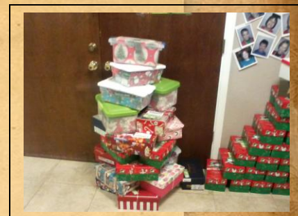
Above: Shoeboxes Collected At PBC this Year

A secularist organization is threatening to sue public schools that take part in Operation Christmas Child (OCC), the “shoebox ministry” run by the Christian organization Samaritan’s Purse. The American Humanist Association (AHA) recently sent letters to two schools, warning them that “in order to avoid the necessity of litigation to end your unconstitutional practices,” they should immediately stop participating in the program, which has provided Christmas gifts in shoeboxes to over 100 million children in over 130 countries in the past two decades. When Samaritan’s Purse distributes the gifts, it also makes a “creative gospel presentation by local churches and ministry partners” and offers an evangelistic booklet. This is the aspect of the program that angers the Humanist organization. In their letter, the AHA went on to state “the boxes of toys are essentially a bribe, expressly used to pressure desperately poor children.... to convert to Christianity.” At least one of the two schools which received the letters has chosen to stop participating in the program to avoid legal entanglements.