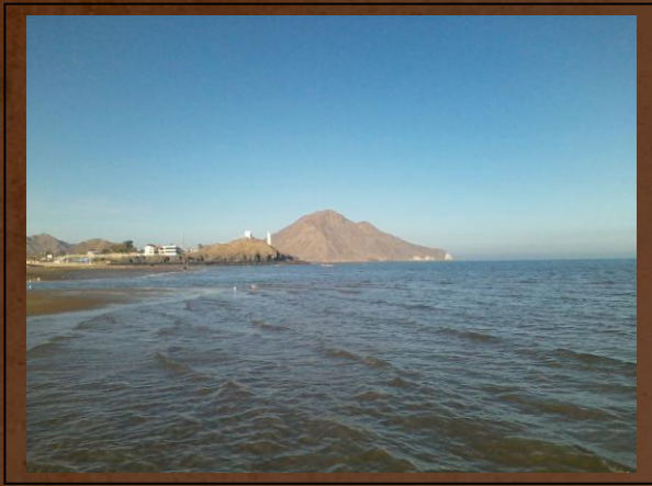
Above: scenic view of Sea of Cortez