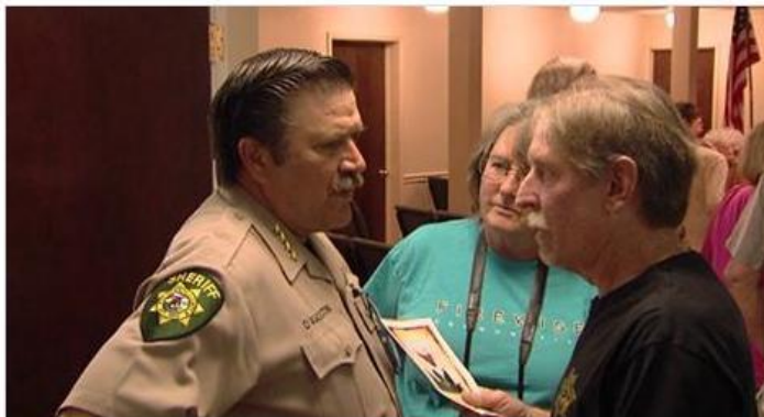
Community Devastated by Sand Fire Rejoices as Flames Approach Full Containment fox40.com

http://fox40.com/2014/07/31/community-devastated-by-sand-fire-rejoices-as-flames-approach-full-containment/