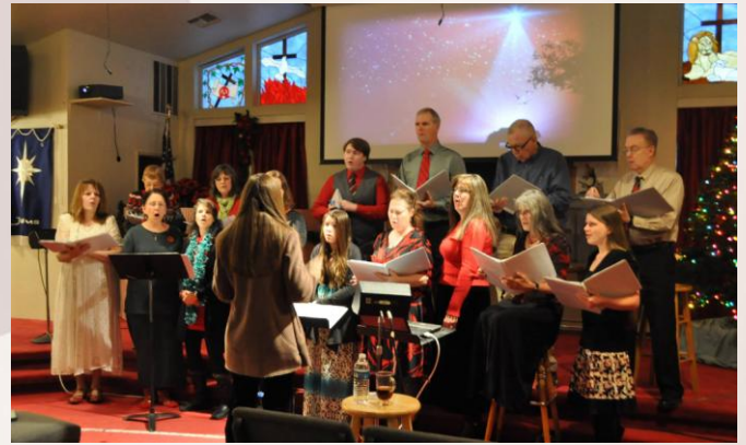
Adult Choir Performance December 21, 2014