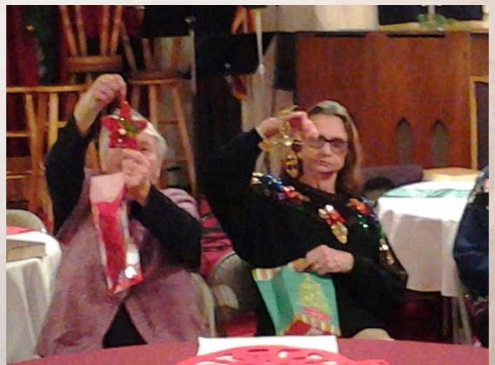
Seniors Ornament Exchange December 4, 2014