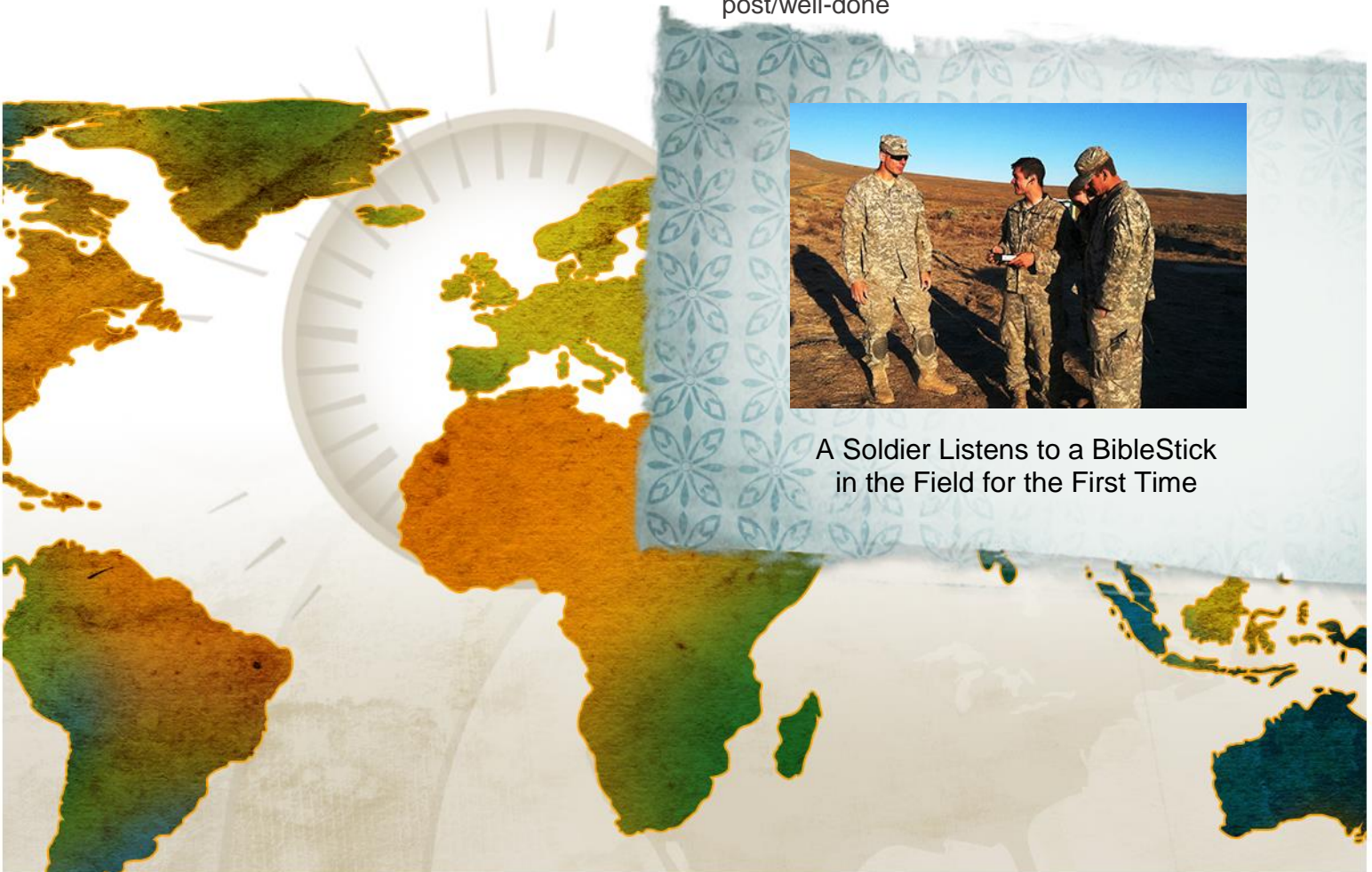
A Soldier Listens to a BibleStick in the Field for the First Time

Reprinted from: www.faithcomesbyhearing.com/news/blog-post/well-done